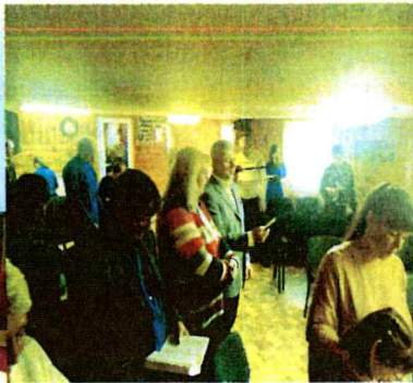
#8,9 Worship service back home in Lida, Belarus on Sunday 25 th