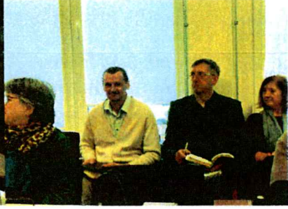
#6 Church visit in Marijampole, Lithuania