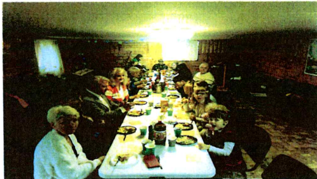
#10 Fellowship around the tables on Sunday 25 th .