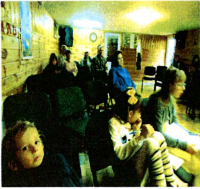
#1,2 Sunday worship service on Sunday 11 th